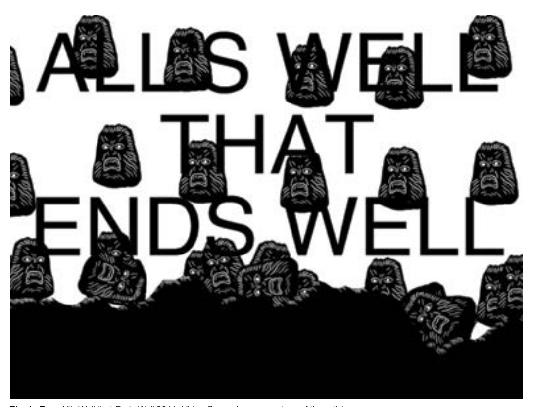
Pippin Barr All's Well that Ends Well 2011, Video Game.