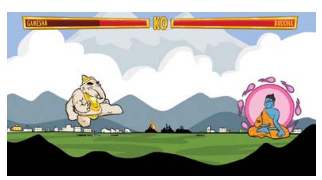
Molleindustria Faith Fighter (detail) 2008, Video Game.